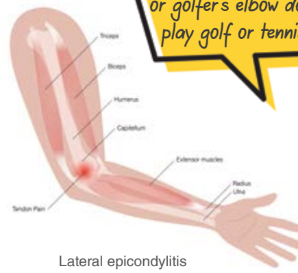
Lateral epicondylitis Tennis elbow